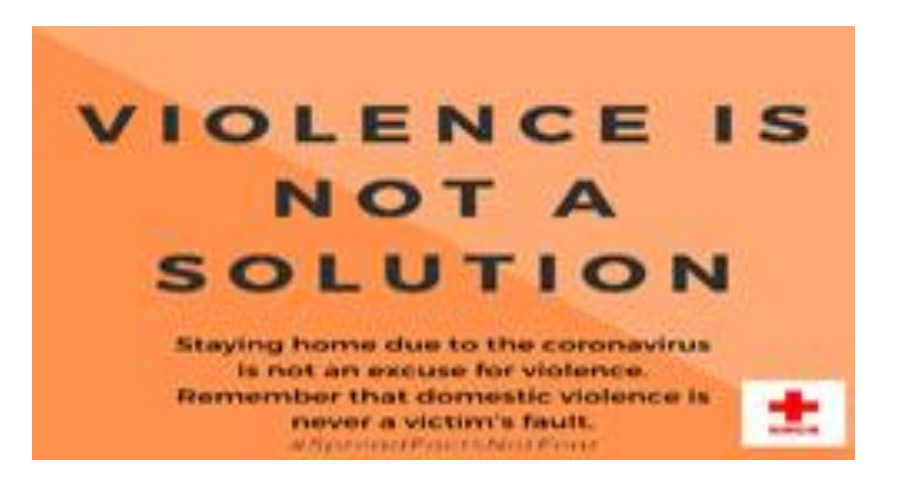
Figure 2. The source, English awareness poster

The following English poster serves as the source for the Nepali poster: