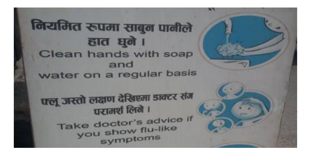
Figure 3. Nepali text preceding English text in a flex board

Some flex boards, flyers, and pamphlets in public spaces carry both Nepali and English texts, communicating the same message in two languages simultaneously. Such bilingual documents differ regarding "code preference" (Scollon and Scollon 2003, 158). When a document involves two languages, Scollon and Scollon observe, the preferred language is positioned uppermost or leftmost. As regards code preference, three types of overtly bilingual documents are discernible: Nepali preferred over English, English preferred over Nepali, and without any fixed order of preference. Of them, Nepali preceding English is found to be the preferred mode of communication of COVID-19 information, as exemplified by the following: