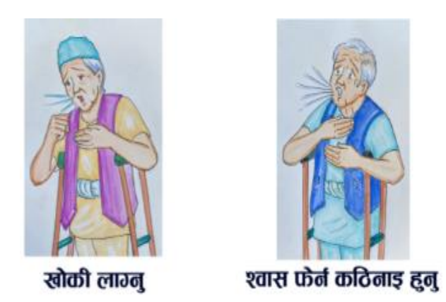
Figure 9. Literal intersemiotic translation in a poster

We can discern two dominant strategies of intersemiotic translation employed in the communication of COVID-19 information. The first is what Pereira (2008) terms literal intersemiotic translation, as evidenced in the following extract from a poster concerning the symptoms of COVID-19 issued by USAID, WHO, and Handicap International.