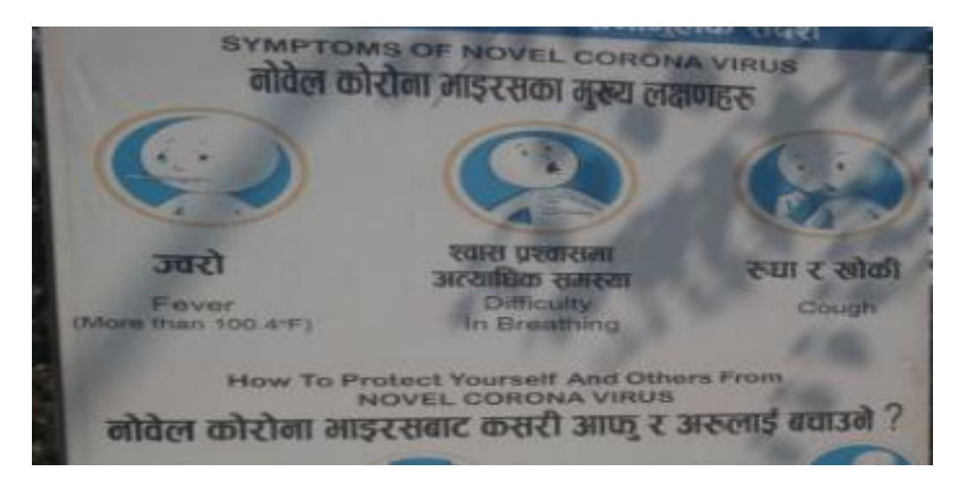
Figure 5. Flex board having a content without code preference

Some documents are also noted for the lack of specific code preference. The following extract from a flex board set up on the roadside represents this category of document: