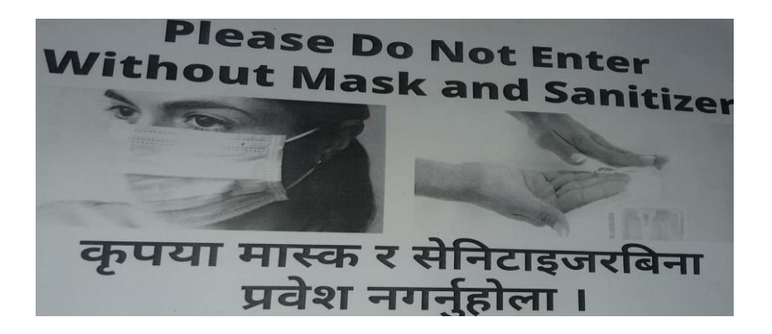
Figure 4. English text preceding Nepali text in a public notice

Some documents are also noted for the lack of specific code preference. The following extract from a flex board set up on the roadside represents this category of document: